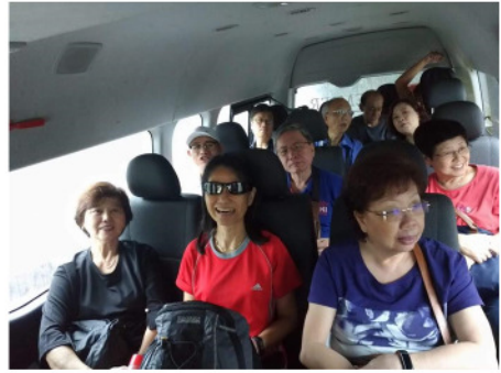
After lunch, on a 15-min journey to the venue by hotel-provided shuttle service