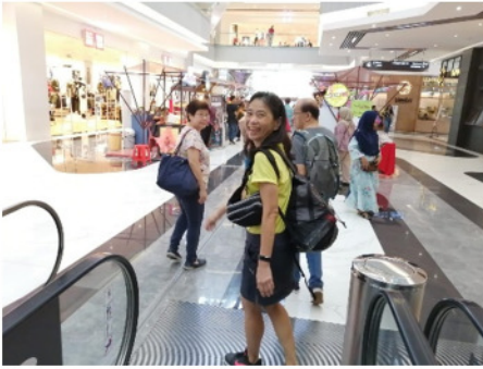
Happily arriving at Batam Ferry Central Point (Time for lunch)